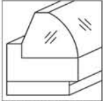
STANDARD END PANEL