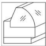
STANDARD END PANEL