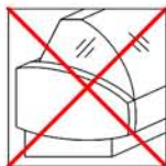
DECORATIVE END PANEL