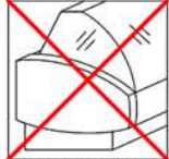
DECORATIVE END PANEL

*Case lengths are specified with standard end panels